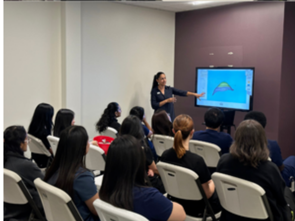
Building the Next Generation of Specialty Eye Care: Keratoconus and Scleral Lens Workshops Across Optometry Programs