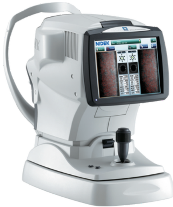
Precision in a Blink: The NIDEK CEM-530 Specular Microscope