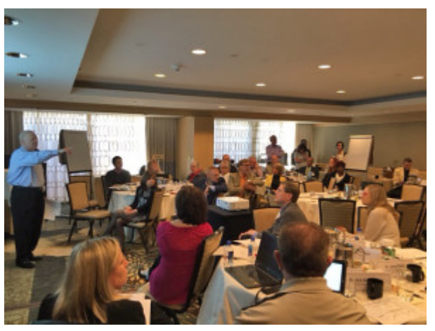
ASCO initiated a new strategic planning process in March.

Information on ASCO's Strategic Plan progress will appear in future editions of Eye on Education.