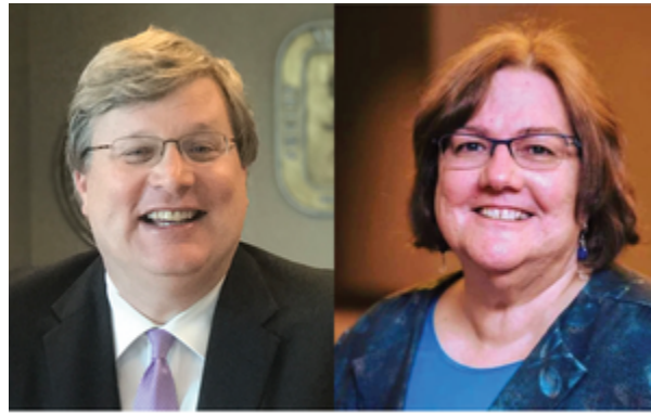
MAYOR JIM STRICKLAND